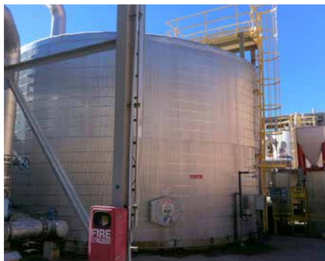
Belzona 4341 can be applied as a lining to protect tanks