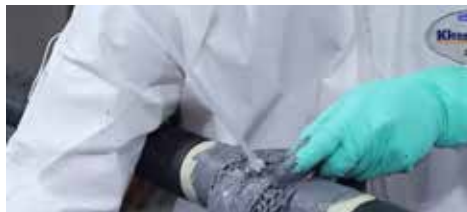
8. Position mesh and sheet