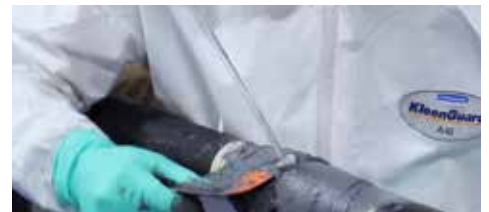
9. Wrap and smooth