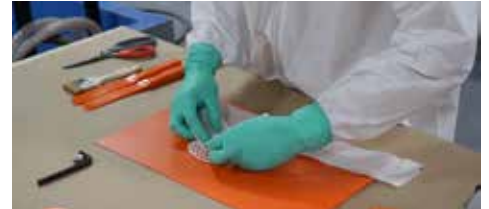
3. Dry-fit sheet to mesh