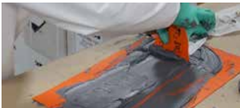
7. Wet-out sheet