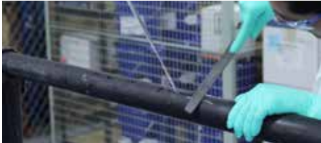
1. Roughen surface