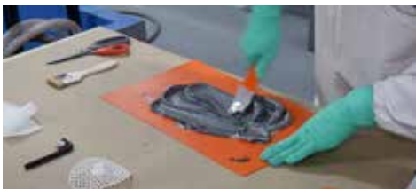
4. Mix Belzona 1212