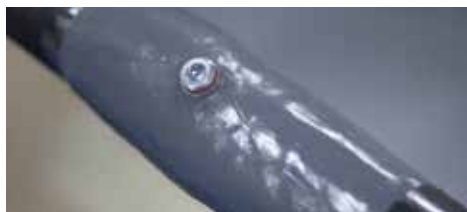
11. Completed application