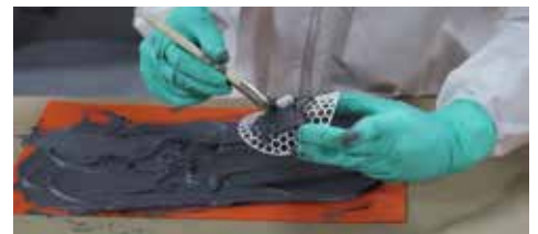
6. Wet-out mesh