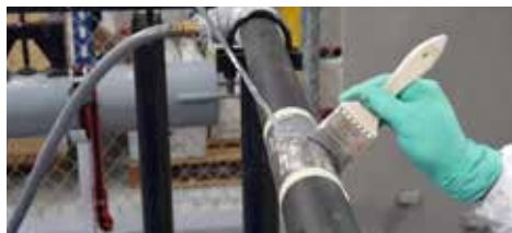
5. Wet-out pipe