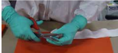
2. Cut hole in the reinforcement sheet