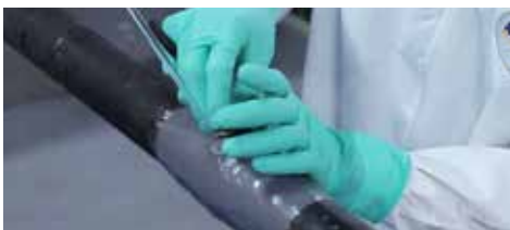
10. Fit bolt and tighten